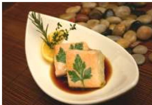
Rice Paper Salmon