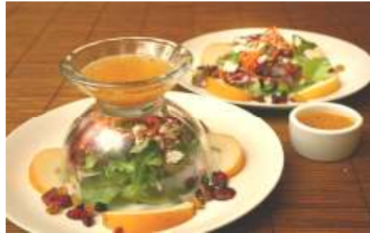
Asian Pear Garden Salad

Grilled salmon filet, garden vegetables and crispy rice vermicelli with hint of black pearl salt. Served with ginger sesame dressing.