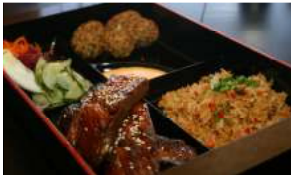
Teriyaki Rib Box