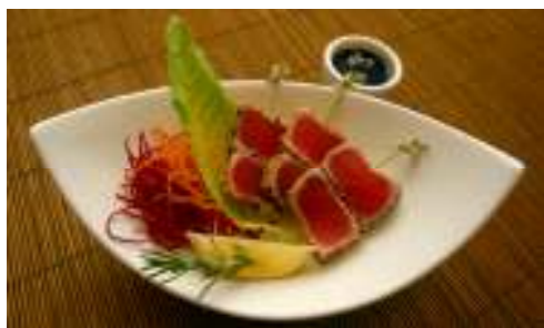
Sesame Tataki Tuna

Goji citrus marinated fresh tuna, avocado, Mango and pineapple served with won ton chips.