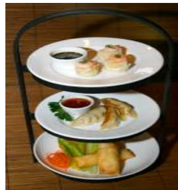
Dim Sum Tower

Tiger shrimp dipped in tempura coconut batter and fried. Served with sweet chile sauce.