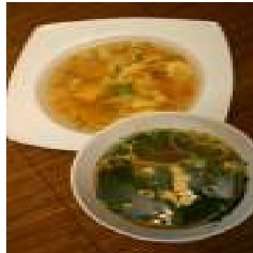
Chicken Egg Drop Soup & Miso Soup

We will try our best to accommodate your dietary restrictions and allergies. Please inform your server when ordering.