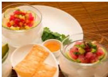
Hawaiian Poke Tuna & Tropical Poke Cocktail

Ibiza shrimp cocktail, black pearl oyster and pacific island ceviche.