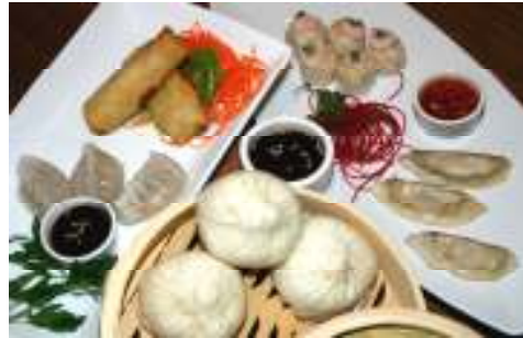
Assortment of Dim Sum

Garden Spring Rolls, Chicken Pot Stickers and Crab Rangoon.