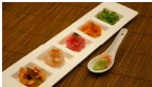
Aqua Sashimi Sampler

Pecan breaded stuffed green chile with sriracha sauce.