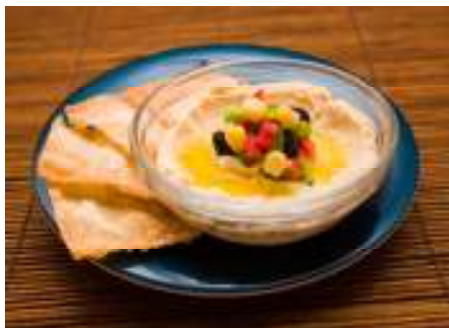
Sesame Tahine Hummus