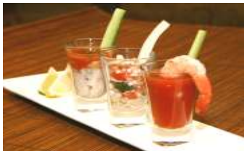
Aqua Reef Trio Shooter Sampler