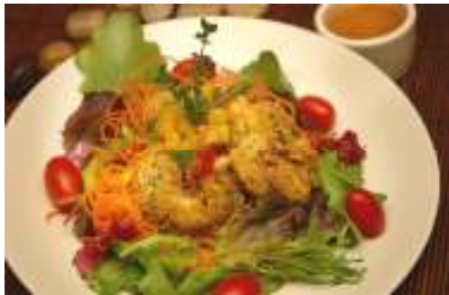
Aqua Reef Island Crab Cake Salad

Sesame seared fresh tuna, garden vegetables, mix greens and crispy wonton strips with hint of bamboo jade sea salt. Served with ginger sesame dressing.