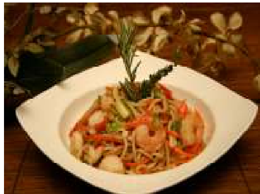
Singapore Seafood Noodles