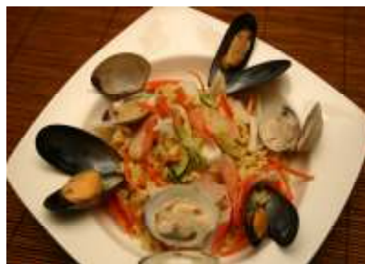
Seafood Asian Paella

Tender chicken and garden fresh vegetables in our original coconut green tea curry sauce. Served with Jasmine rice.