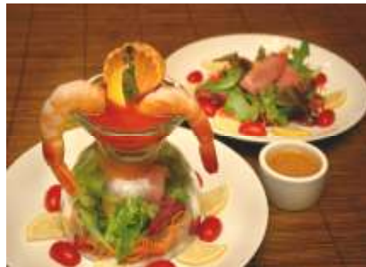
Shrimp Cocktail, Prosciutto and Melon Salad

Spanish style shrimp cocktail, prosciutto wrapped melon, cucumber, grape tomatoes, feta cheese and baby mixed greens. Served with Himalayan goji berry vinaigrette.