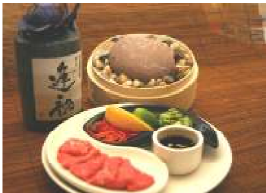
Hot Rock with Kobe Japanese Wagyu Beef