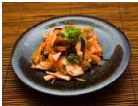
Ika Sansai Squid Salad