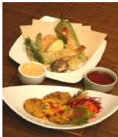
Combination Tempura & Island Crab Cake

Imported Japanese Kobe beef marinated in special sauce.