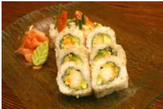
Tempura Shrimp Roll