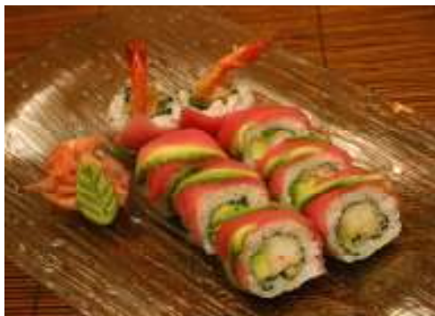
Hot Night Roll

Baked shrimp, crab, avocado, scallion and tobiko roll with dynamite and sriracha sauce.