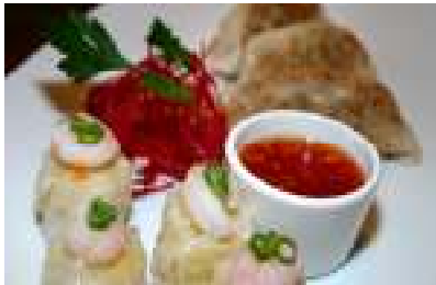
Chicken Gow Gee & Seafood Siew Mai

Pan fried chicken and vegetable pot stickers. Served with ginger sesame sauce